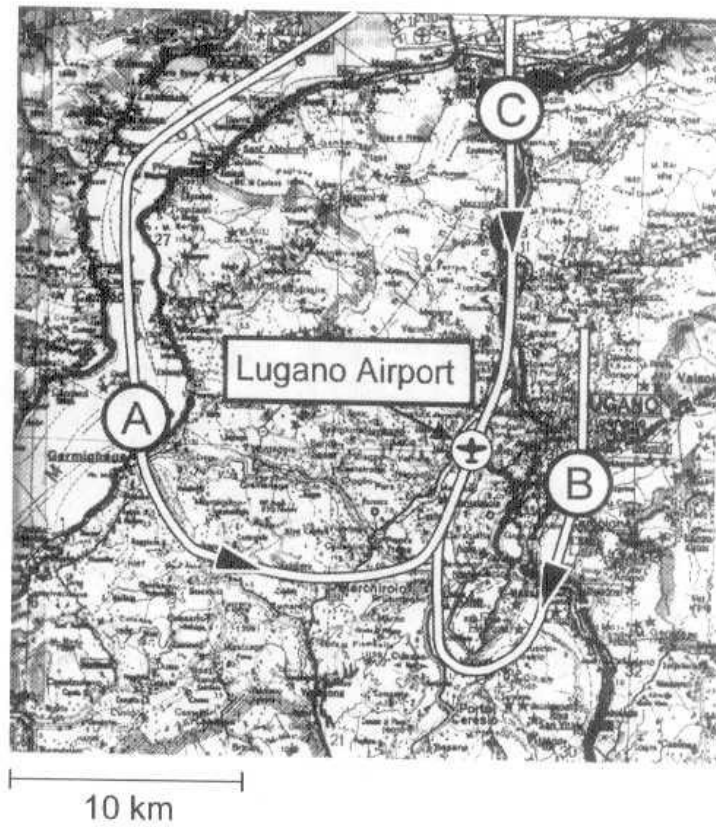
Fig. 19 Flight test routes for curved and steep approaches at Lugano airport