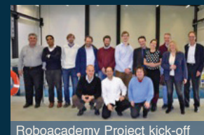
Roboacademy Project kick-off