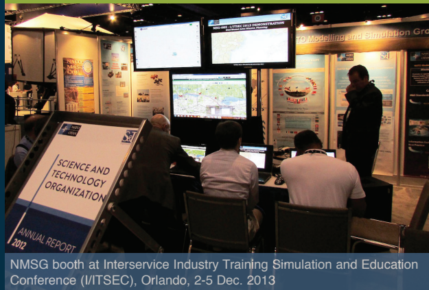
NMSG booth at Interservice Industry Training Simulation and Education Conference (IITSEC), Orlando, 2-5 Dec. 2013