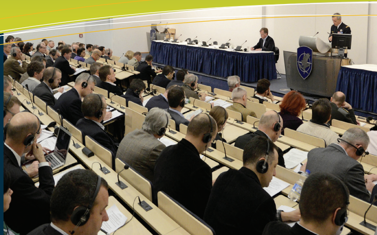
2014 NATO Defence Planning Symposium