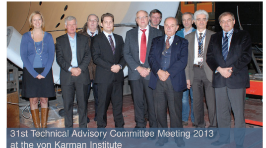
31st Technical Advisory Committee Meeting 2013 at the von Karman Institute

The review included an assessment of the importance of VKI's programs and activities to NATO, a review of the Institute's achievements over the past academic year and a review of plans for the following and subsequent years.